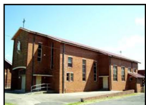
St Peter-in-Chains', Stockton