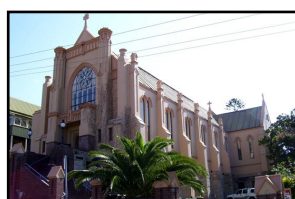
St Mary, Star of the Sea, Newcastle