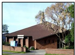
Christ the King, Mayfield West