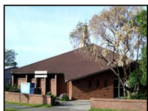
Christ the King, Mayfield West