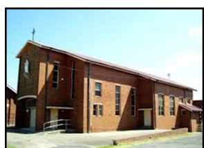
St Peter-in-Chains', Stockton