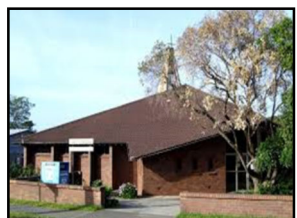
Christ the King, Mayfield West