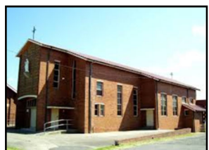
St Peter-in-Chains', Stockton