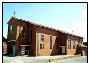
St Peter-in-Chains', Stockton