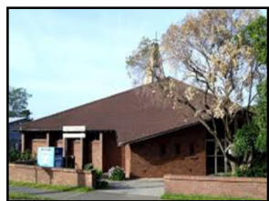
Christ the King, Mayfield West