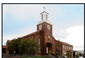
Immaculate Heart of Mary, Tighes Hill