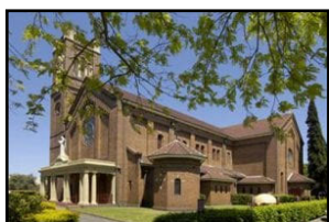
Sacred Heart Cathedral, Hamilton