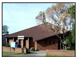
Christ the King, Mayfield West