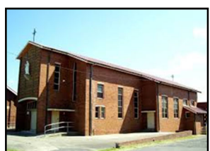
St Peter-in-Chains', Stockton