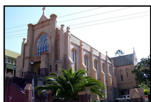
St Mary, Star of the Sea, Newcastle