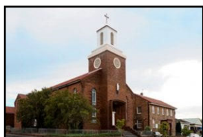
Immaculate Heart of Mary, Tighes Hill