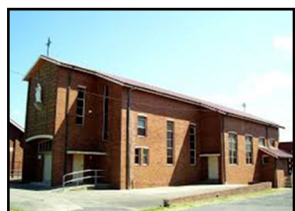
St Peter-in-Chains', Stockton