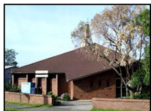
Christ the King, Mayfield West