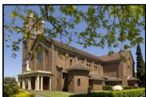
Sacred Heart Cathedral, Hamilton