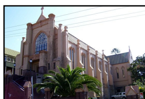
St Mary, Star of the Sea, Newcastle