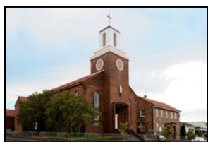
Immaculate Heart of Mary, Tighes Hill