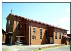
St Peter-in-Chains', Stockton