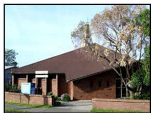
Christ the King, Mayfield West