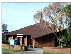
Christ the King, Mayfield West