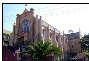
St Mary, Star of the Sea, Newcastle