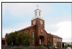
Immaculate Heart of Mary, Tighes Hill