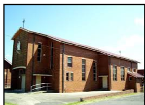
St Peter-in-Chains', Stockton