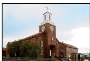
Immaculate Heart of Mary Tighes Hill