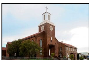
Immaculate Heart of Mary Tighes Hill