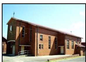
St Peter-in-Chains Stockton