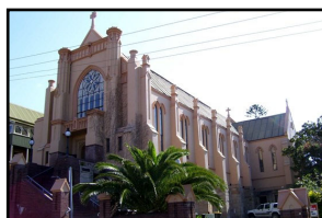
St Mary, Star of the Sea Newcastle