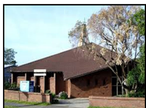
Christ the King Mayfield West