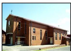
St Peter-in-Chains Stockton