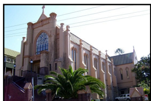
St Mary, Star of the Sea Newcastle