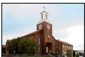
Immaculate Heart of Mary Tighes Hill