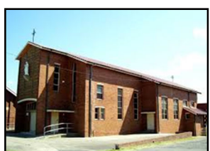
St Peter-in-Chains Stockton