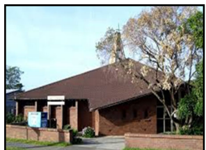
Christ the King Mayfield West