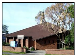
Christ the King Mayfield West