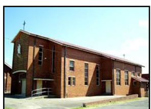
St Peter-in-Chains Stockton