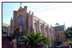
St Mary, Star of the Sea Newcastle