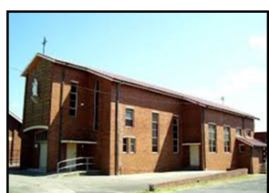
St Peter-in-Chains Stockton