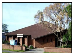
Christ the King Mayfield West