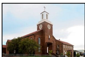
Immaculate Heart of Mary Tighes Hill