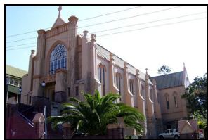
St Mary, Star of the Sea Newcastle