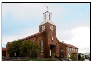
Immaculate Heart of Mary Tighes Hill