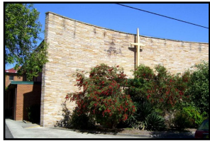
St Joseph's The Junction