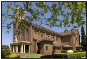
Sacred Heart Cathedral Hamilton