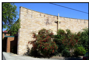
St Joseph's The Junction