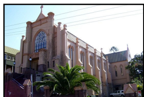
St Mary, Star of the Sea Newcastle