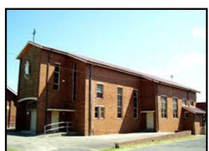
St Peter-in-Chains Stockton