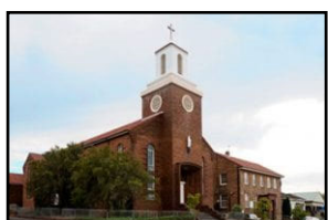
Immaculate Heart of Mary Tighes Hill