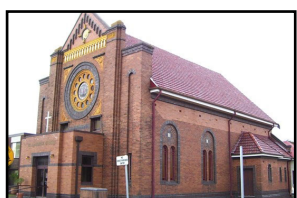
St Laurence O'Toole Broadmeadow