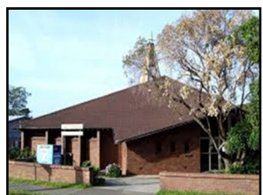
Christ the King Mayfield West