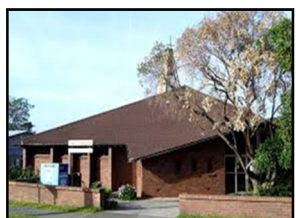
Christ the King Mayfield West