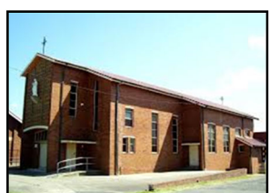
St Peter-in-Chains Stockton