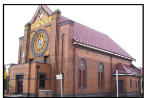
St Laurence O'Toole Broadmeadow