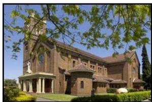
Sacred Heart Cathedral Hamilton