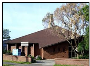
Christ the King Mayfield West