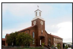
Immaculate Heart of Mary Tighes Hill