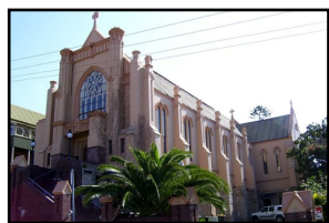
St Mary, Star of the Sea Newcastle