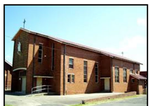
St Peter-in-Chains Stockton