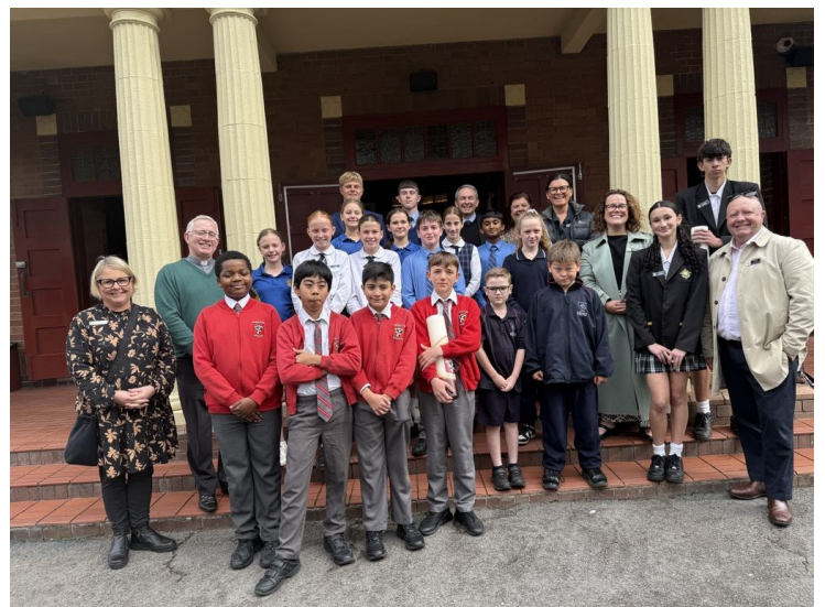
Schools at St Mary of the Cross feast day in The Cathedral on Friday 8 August: St Joseph's, St Columban's, San Clemente, St Francis Xavier's and St Dominic's.

Formation for those who were unable to attend our previous sessions will be held on Sunday, 17 August at 3.00pm in Sacred Heart Cathedral . This is an informal opportunity to have a conversation around process and rosters. Anyone thinking these ministries might be for you is invited to attend, as well as those who have been generously volunteering for ever.